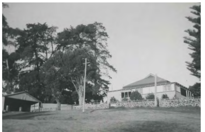
Archival images of Edge-hill provided by the Shire of Harvey Heritage Advisory Committee