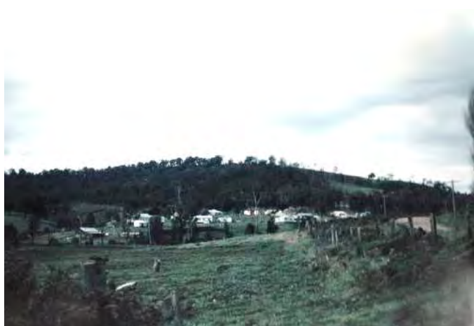
Roelands Mission, 1960s