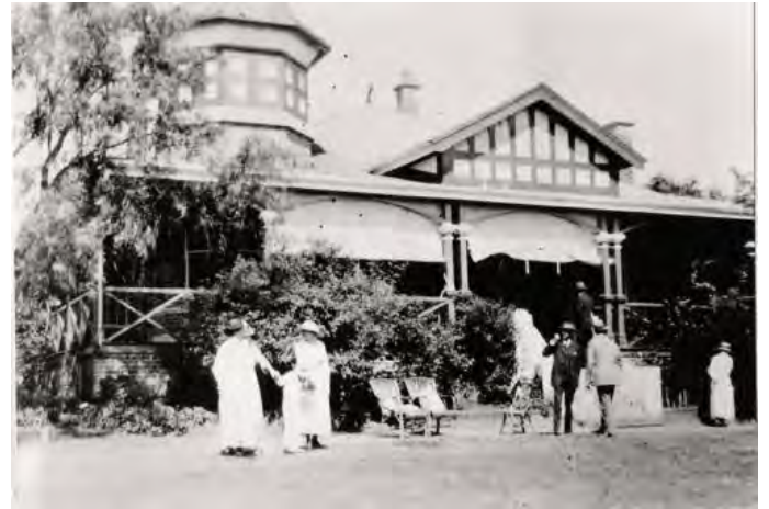
Wedderburn Park, 1920s