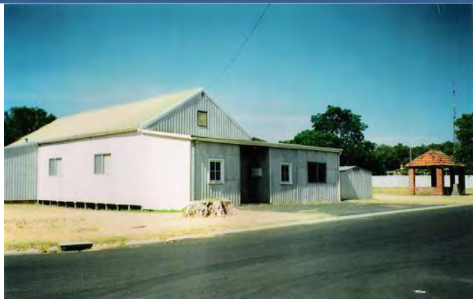
Roelands Hall and memorial, n.d.