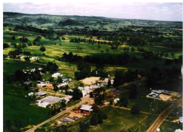
Roelands, 1950s