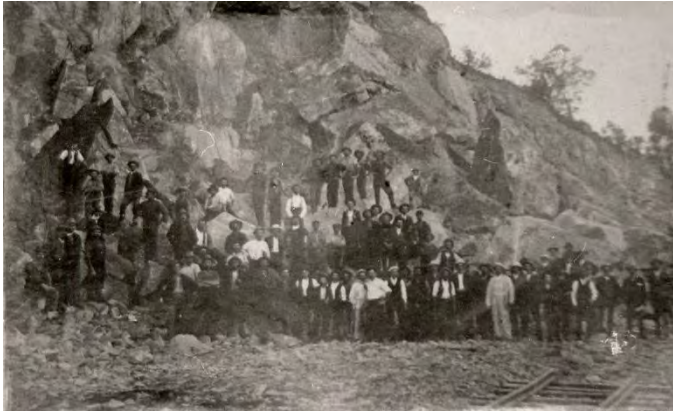
Archival images of the Roelands Quarry, n.d.