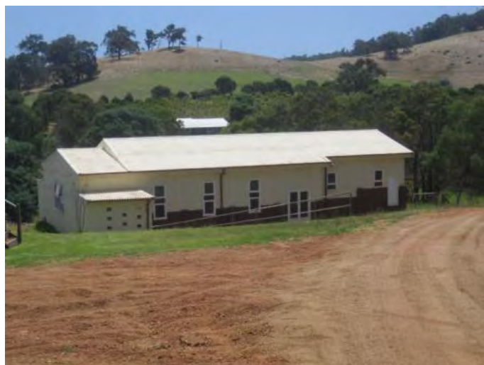
Roelands Village, various dates.