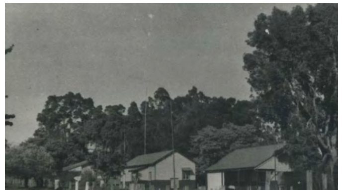
Archival images of the former PWD building in Roelands