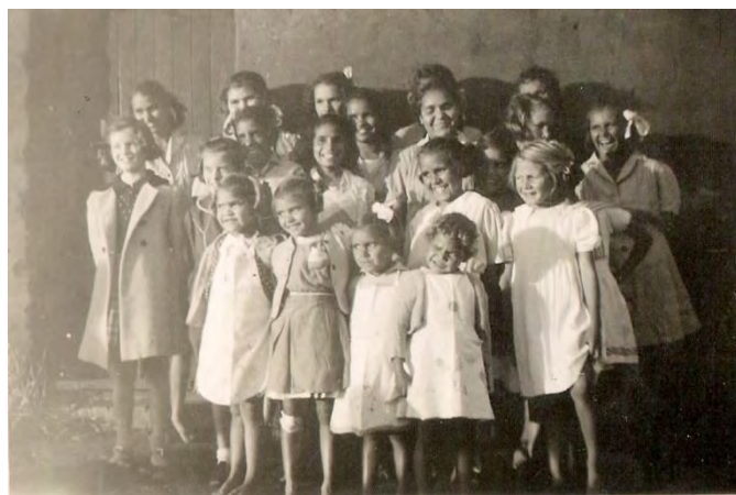
Roelands Native Mission, 1941-42