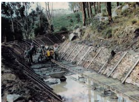
Typical irrigation works near Roelands, 1950s