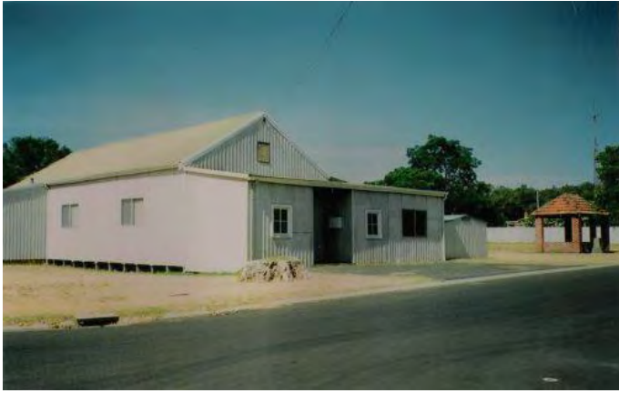
Roelands Hall and Memorial, n.d.