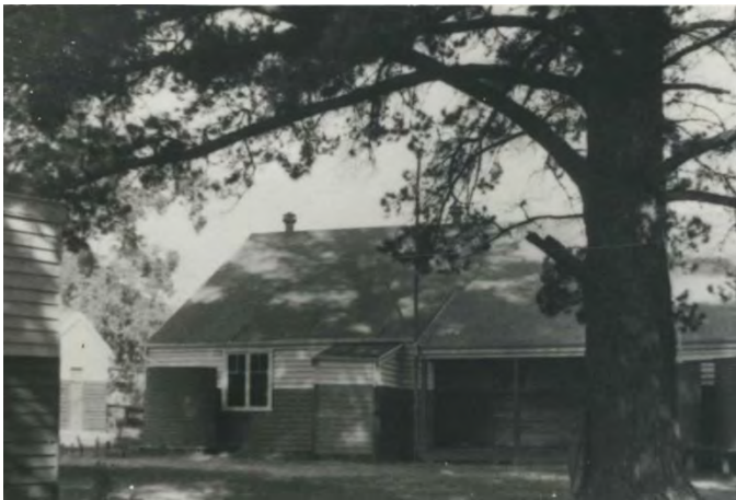
Roelands School, n.d.