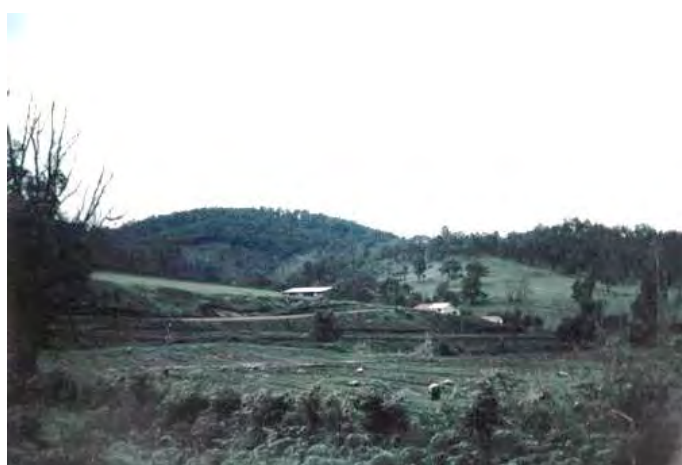
Roelands Mission, 1960s