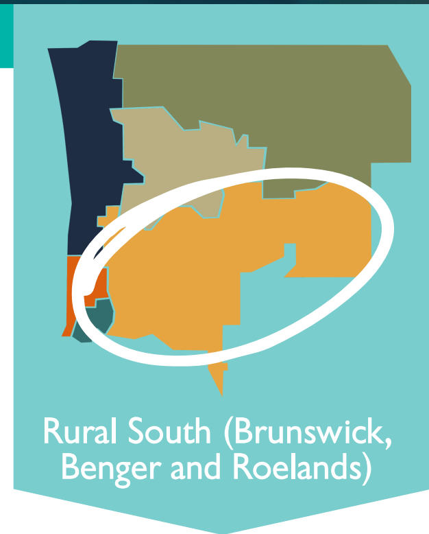
Rural South (Brunswick, Bengel and Roelands)