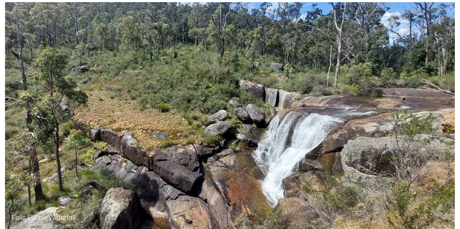
Falls Brook Waterfall