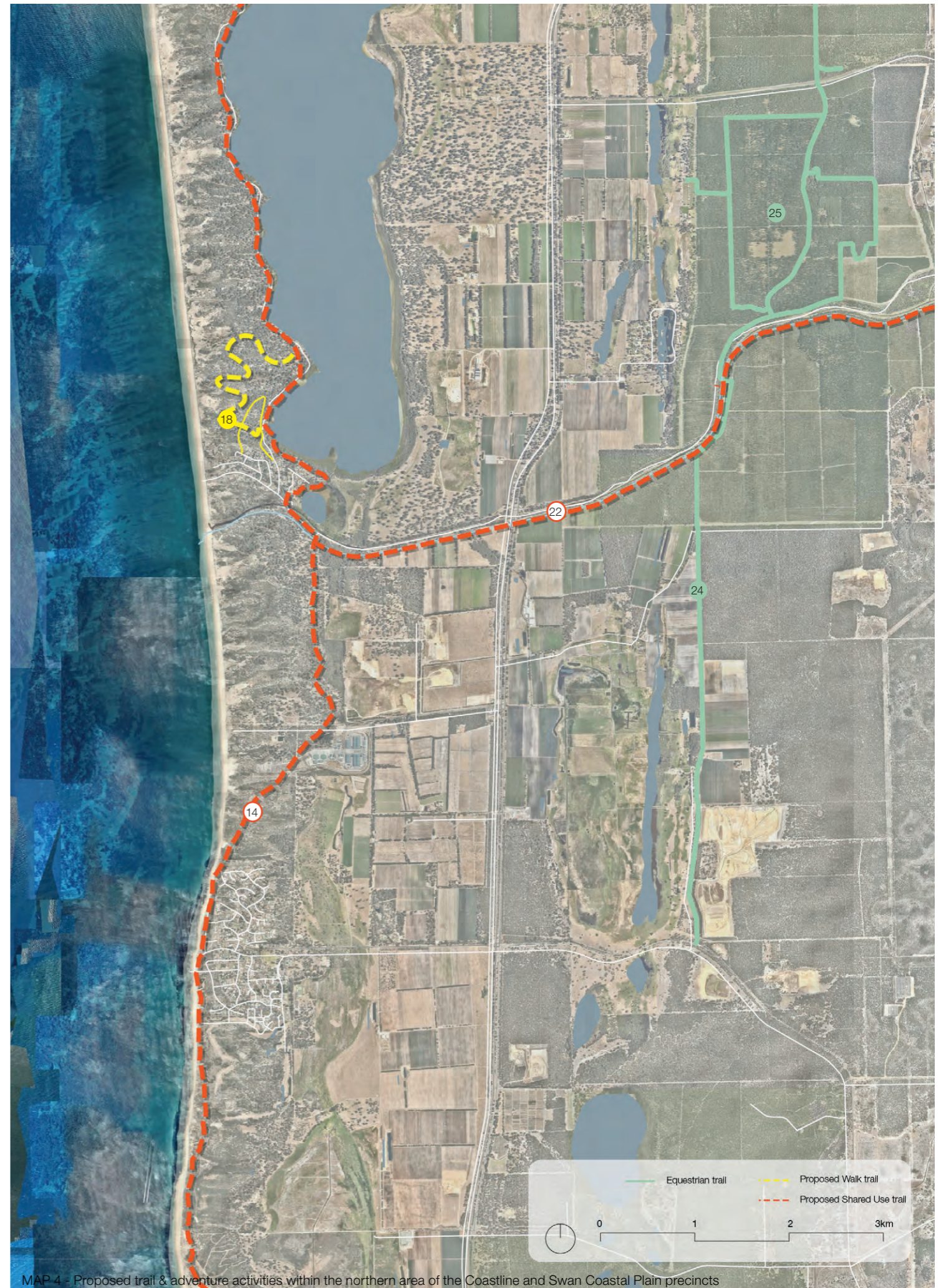
MAP 4 - Proposed trail & adventure activities within the northern area of the Coastline and Swan Coastal Plain precincts