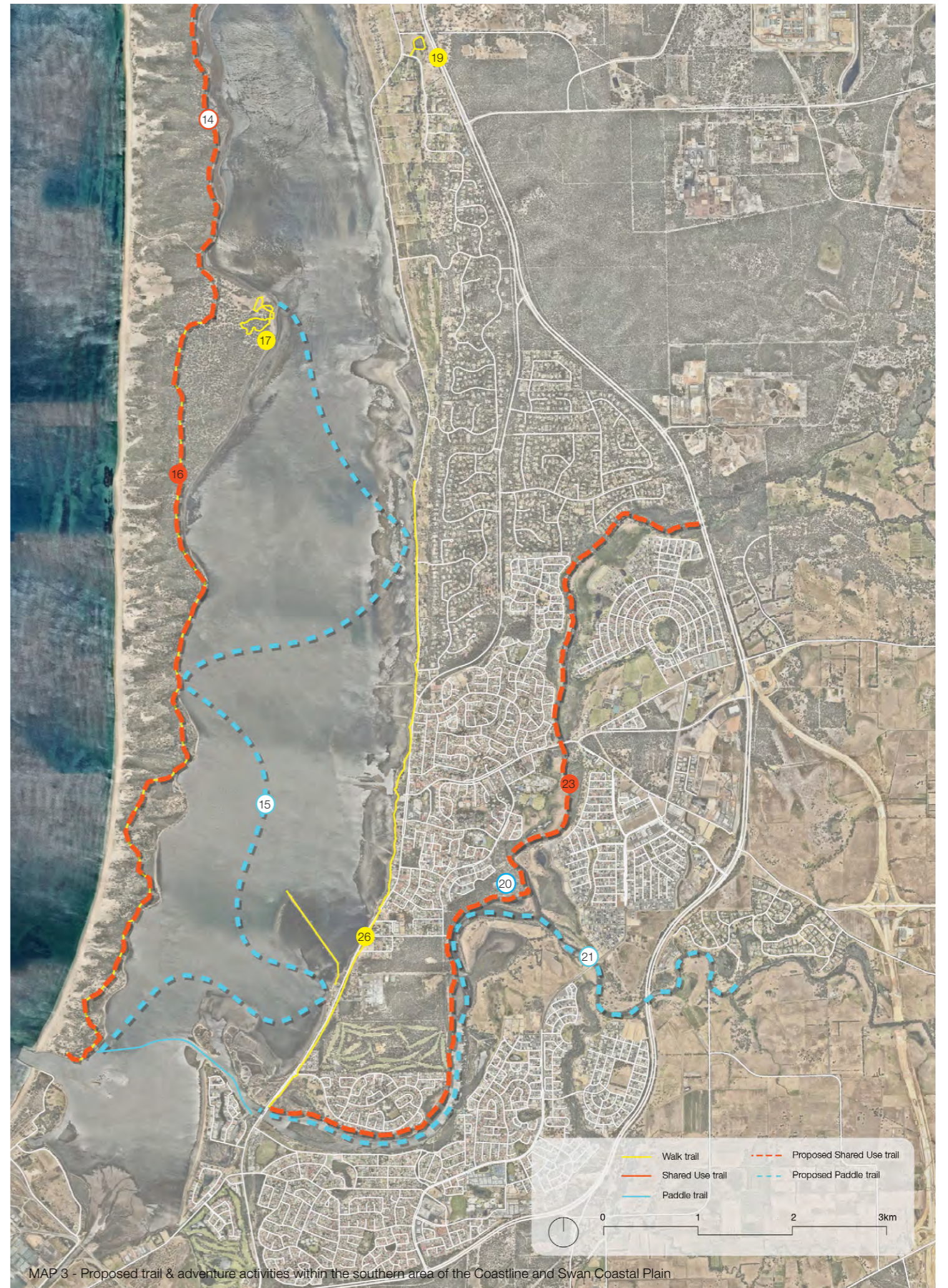
MAP 3 - Proposed trail & adventure activities within the southern area of the Coastline and Swan Coastal Plain