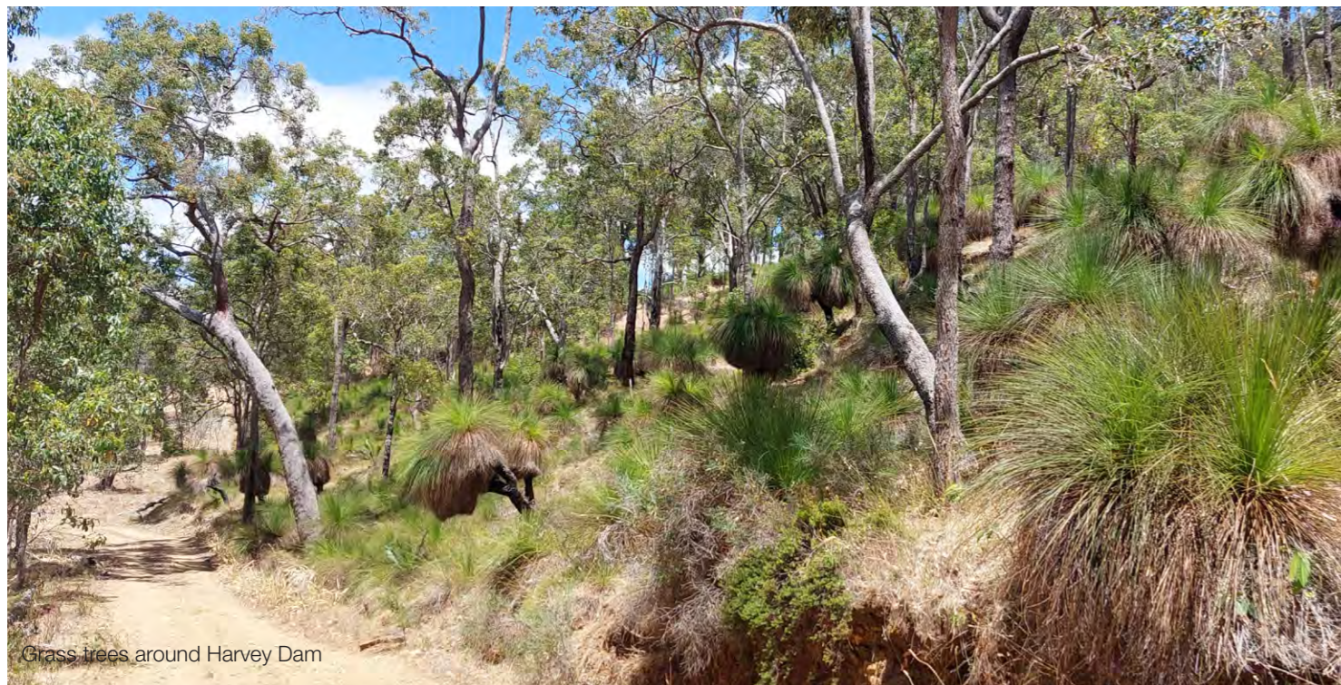
Grass trees around Harvey Dam

A leisurely walk through Yarloop, the Heritage Trail meanders through the town's streets to the sites of former and current historical buildings and infrastructure lost in the January 2016 bushfires. An important memorial, regular audits to maintain the trail experience and signage is recommended.