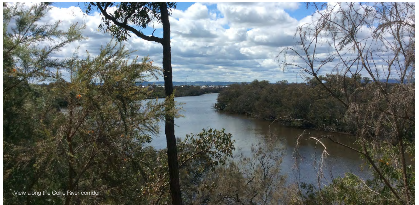
View along the Collie River corridor

Making use of the existing road cycling routes, develop a series of marketable routes throughout the area and across the landscape character precincts. Utilising the network of quieter sealed roads in the region, the routes could connect key points of interest such as heritage sites, scenic lookouts, cafes and pubs. These routes should be detailed in online and print and signposted at key intersections on the ground. Information for each route should include, access, distance, elevation, optional features, points of interest and scenic values.