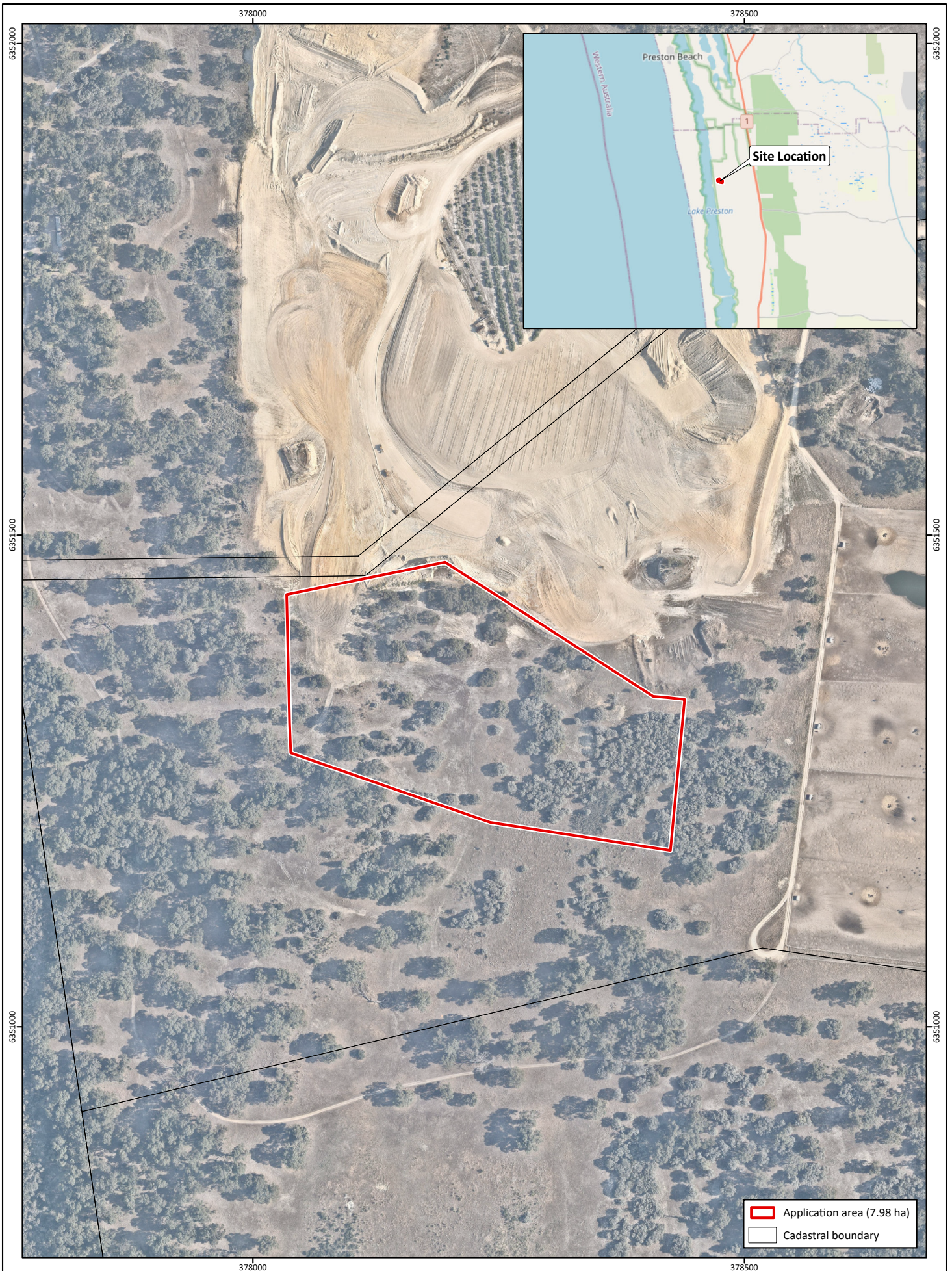
Figure 4: Extractive Industry and Clearing Application Area: Lot 5 Ludlow Road, Myalup

Project: Extractive Industry and Clearing Application Lime Sands Operation Expansion Client: B & J Catalano